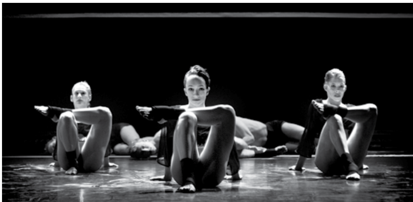
Gallim Dance in Blush.

Blush has received touring support from the New York State Council on the Arts with the support of Governor Andrew Cuomo and the New York State Legislature, the Fan Fox and Leslie R. Samuels Foundation, MetLife Community Connections Fund of the New England Foundation for the Arts' National Dance Project, the Mid Atlantic Arts Foundation through USArtists International in partnership with the National Endowment for the Arts and the Andrew W. Mellon Foundation, as well as the Foundation for Contemporary Arts Emergency Grant.